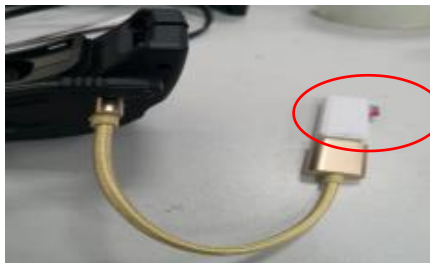
USB storage device