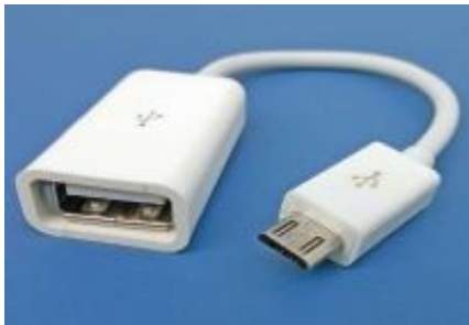
OTG upgrade USB cable