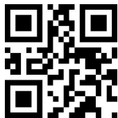
image flip mode