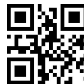
RSS min length at 4

Scan following code to set max length of RSS