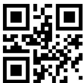
RSS min length at 0

Scan following code to set min length of RSS