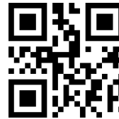
*MSI min length at 4