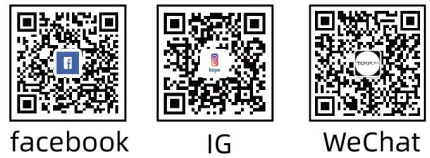
facebook IG WeChat

了解产品详细信息, 请访问tcmm官方网站 For product details, please visit the official website of TCMM http://www.tcmm-rc.com QQ: 1585921319 WhatsApp: +86 15323773561 Email: tcmmrc@tcmm-rc.cn