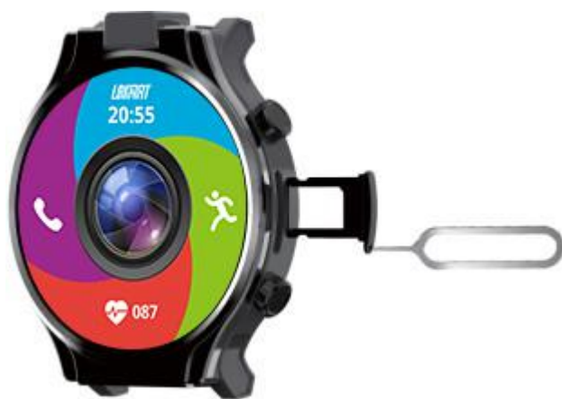
Use a tool to remove the SIM card tray.