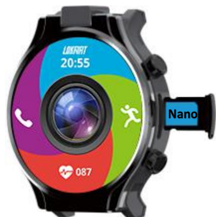
Fixed SIM card insertion