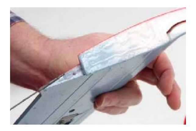
7. Insert the aileron servo wire through the hole in the fuselage and then push the wing panel into position